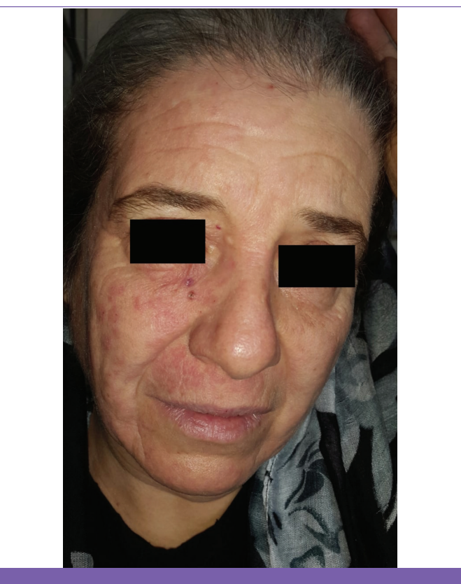
Figure 6. Rosacea like lesion of tinea in 52 years old female