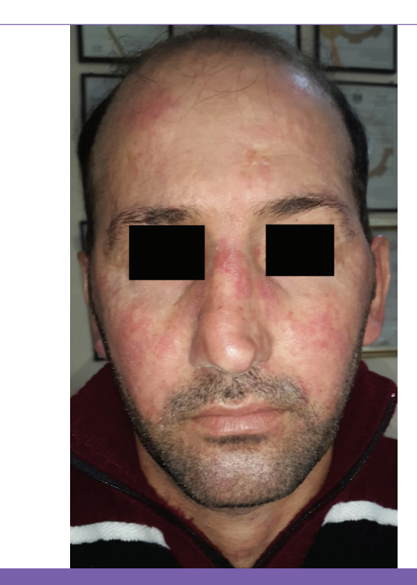
Figure 7. Tinea lesions on the malar area resembling lupus erythematosus in 29 years old male