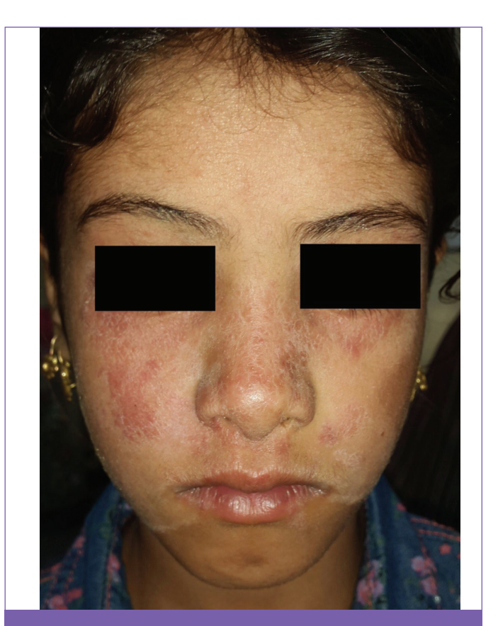
Figure 2. Atopic dermatitis like lesion of tinea in 8 years old female