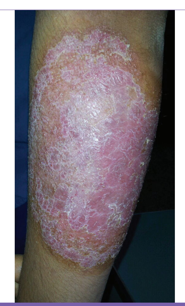
Figure 1. Psoriasis like lesion of tinea on the leg of 23 years old male

All patients had atypical clinical presentation (Figures 1-8) with prior misdiagnosis or suspicion of different non-fungal skin diseases receiving various topical and systemic therapies while KOH examination was positive for all included patients. Both by PCR and/or culture for the 92 patients, dermatophyte was detected in 63 (68%) out of 92 samples. PCR positive were 57 (90%) of 63 samples, culture positive was 43 (81%). The dermatophyte species isolated were belonged to the 3 genera T, E and M. Eight dermatophytes