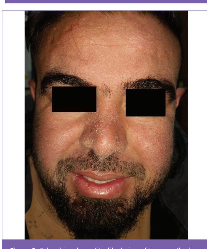
Figure 3. Seborrhiec dermatitis like lesion of tinea on the face of 21 years old male