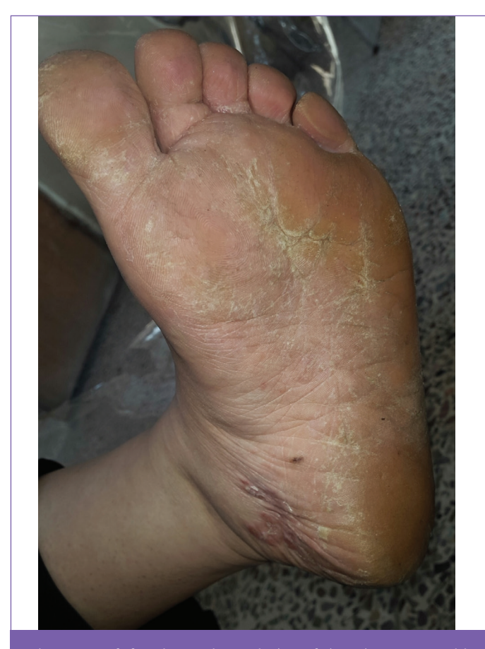
Figure 4. Left foot keratoderma lesion of tinea in 40 years old female