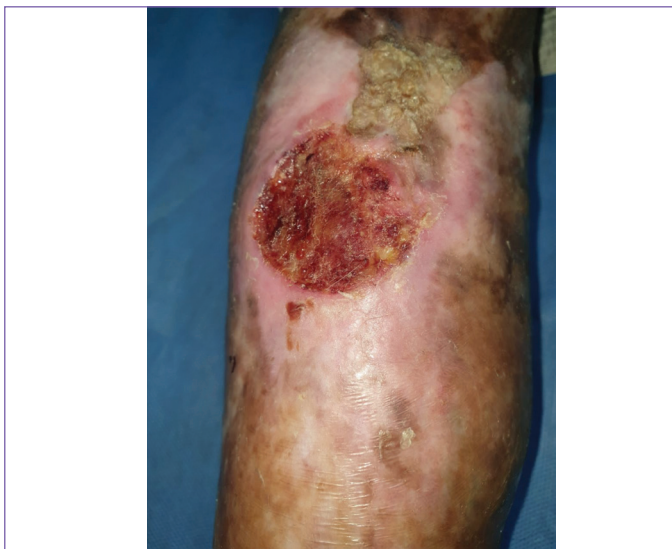
Figure 2. Twenty-eight years old male with post-burn squamous cell carcinoma of right leg

The frequency of SCC among all patients with burn scars, in the current study was (6.97%), this figure is comparable to one study [19] but slightly higher than other published works [20,21]. This finding is not surprising as sunny climatic condition during the whole year time and the early continuous sunlight exposure during outdoor activities in correlation with job time is more important for development of SCC [22].