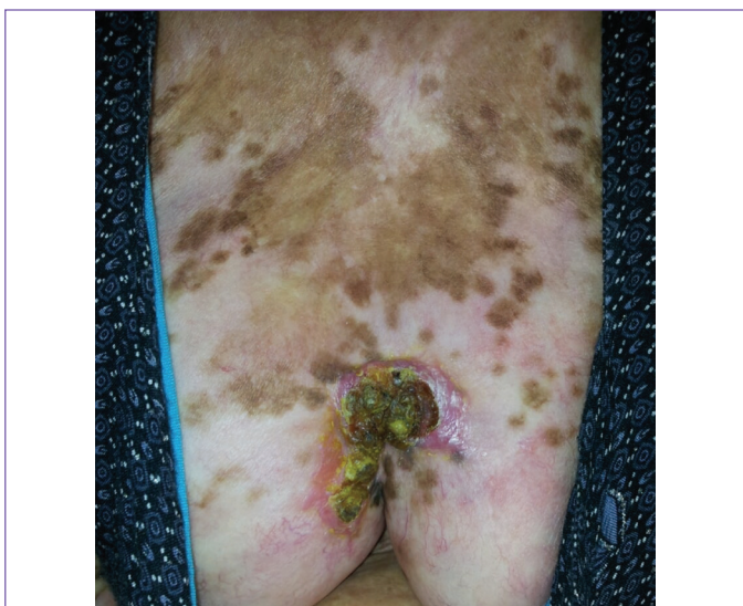
Figure 3. Twenty-five years old female with post burn squamous cell carcinoma on the buttock

Generally, SCC is mostly seen at the head/neck, while SCC arising on burn scars is frequently localized on lower extremities, where the trauma risk is high and the blood flow is low [16] in addition, the extremities are more susceptible to deep burns than other sites of the body. In the present work, 6 (50%) of 12 SCCs developing on burn scars were localized on lower extremities, 5 (41.66%) cases on the upper limbs and one (8.33%) case on the scalp. These results are in agreement with other studies [14,17,19].