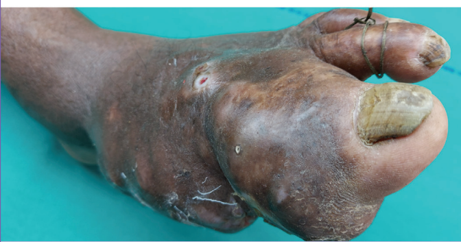
Figure 1. 8 cm x 6 cm sized nontendered swelling with multiple sinuses discharging