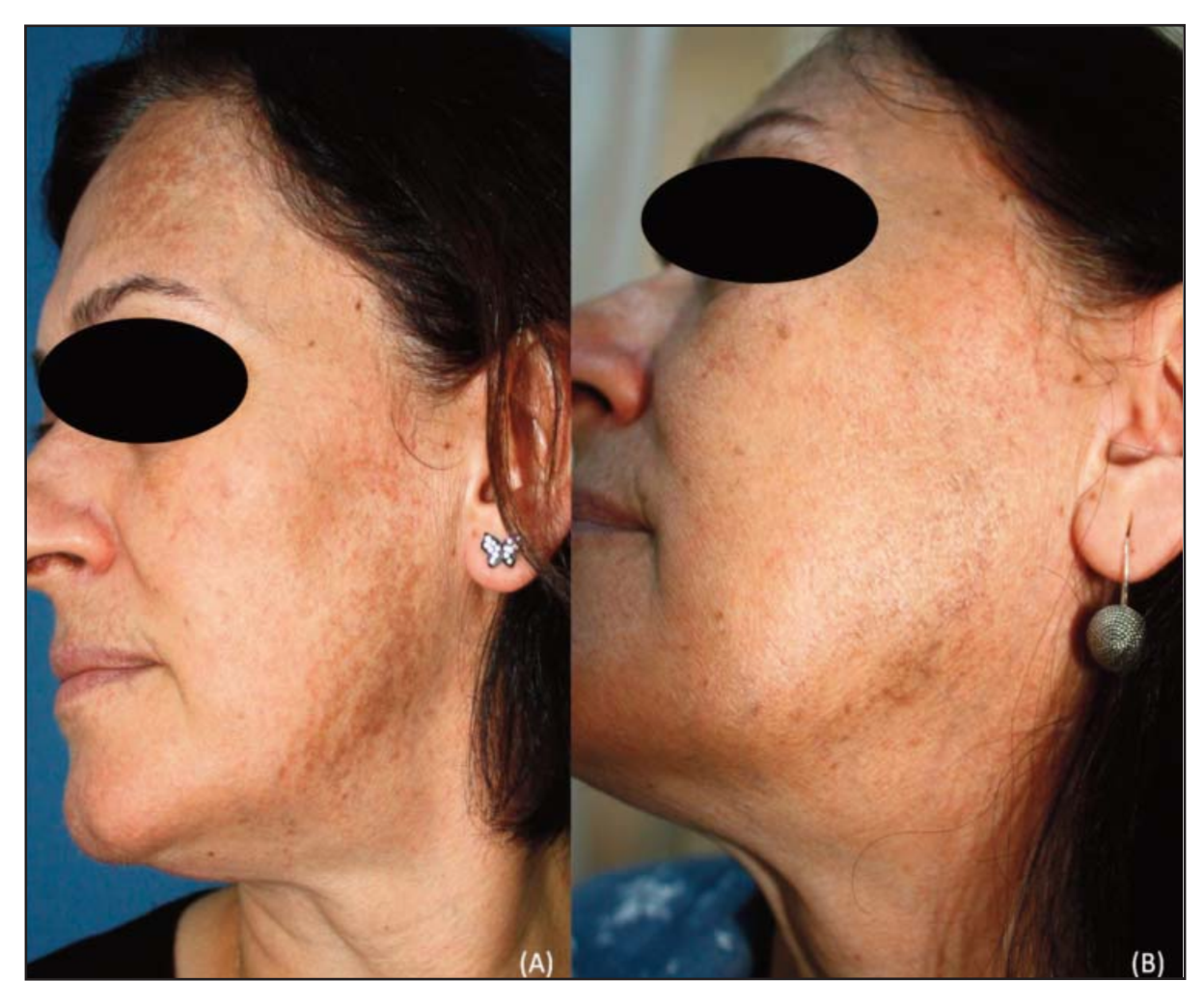
Figures 1a and b. Confluent brownish maculopapular lesions on the face of case 1 at initial presentation (A). After 3 months of therapy, almost completely improvement of the lesions (B).

was no abnormality in thyroid hormone levels. Owing to involvement of sun-exposed sites, lupus serological profile was performed. Antinuclear antibody (ANA) and syphilis serology were normal. Skin biopsies were performed from both facial and acral lesions with the presumptive diagnosis of pigmented lichen. Microscopic examination revealed lichenoid infiltration with loose formed granulomas ( Figures 2a and b ). A few giant cells were seen. Second biopsy also showed significant pigment incontinence ( Figure 2c )