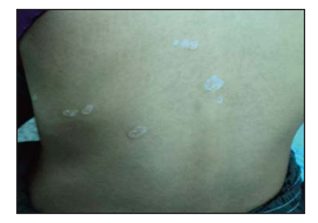
Figure 1. Hypopigmented plaques in the back

rare variant favor the trunk and proximal aspects of the extremities. They occur in 15% to 20% of patients [1]. They may be localized or widespread and typically affect the neck, inframammary area, shoulders, wrists, and inner part of the thighs. In contrast to genital LS, which is accompanied by itching, burning, and dysuria, extragenital LS is typically asy mptomatic [2]. However, progressive disease may cause discomfort and pruritus [3]. LS has an autoimmunological background. Circulating basement membrane antibodies and antibodies against the extracellular matrix protein 1 have been found in patients with LS, and an association of LS with other autoimmune diseases is frequent [4,5,6].