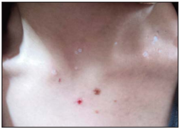
Figure 2. Hypopigmented papules on the neck

Treatment of extragenital LS included application of super-potent topical glucocorticoids with or without topical calcineurin inhibitors for long-term daily use, Phototherapy, especially UVA1, is a treatment modality treatment modality that has been shown to clear extragenital lesions more effectively than genital l