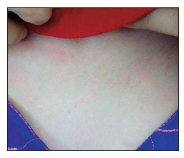
Figure 7. Lesions after treatment

The exact mechanism of action of PCMT in sclerotic skin diseases is still unknown. It seems that PCMT combines the early anti-inflammatory effects of corticosteroids with the prolonged antifibrotic effects of methotrexate[15]. Methotrexate inhibits several cytokines that play a central role in sclerotic skin diseases, such as interleukins 2,4 and 6 [16]. Interleukin 6 has been shown to be upregulated in LS and localized scleroderma and seems to parallel with the extent of disease and response to treatment [17]. Although orally adm inistered low-dose methotrexate causes adverse effects in the gastrointestinal tract (e.g. nausea or vomiting), liver (elevations in liver enzyme levels), and central nervous system (e.g. dizziness or headache in about one-third of patients), clinically relevant complications,