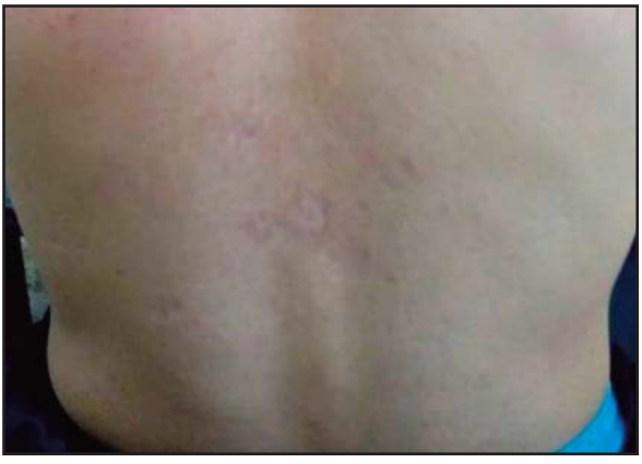
Figure 6. Lesions after treatment

fortunately, are rare. In clinical trials of methotrexate therapy for rheumatoid arthritis, life threatening pancytopenia and methotrexateinduced lung disease have been observed in 1.4% and in 2.1% to 6.8% of patients, respectively. Although the typical longterm adverse effects of corticosteroids usually do not occur with high-dose treatment, physicians should be aware of rare severe adverse events such as aseptic bone necrosis, anaphylaxis, or even sudden death in patients with renal insufficiency and/or imbalances in electrolyte levels [7]. Therefore, patients should be carefully monitored while receiving CMT, especially those with a history of liver , cardiac, and renal disease.