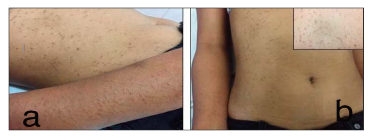
Figures 1a and b. Showing presence of multiple papular lesions over trunk and arms (with inset showing close-up of the abdominal lesions)

tive syringomas and generalised lichen planus was kept. After taking informed consent, skin punch biopsy was taken from lesion on arm which reported an epithelial neoplasm involving upper reticular dermis and made up of solid epithelial islands and ductal structures which were lined with two or three layers of cuboidal cells. These cells present in solid cords showed attempt towards ductal differentiation. Stroma was made up of thickened collagen bundles with impression of syringoma. All other routine laboratory investigations were normal. Based on clinical and histopathology findings, a final diagnosis of generalised eruptive syringomas was made and patient was treated with isotretinoin 20mg daily. The degree of response to treatment could not be seen as the patient did not come for follow up.