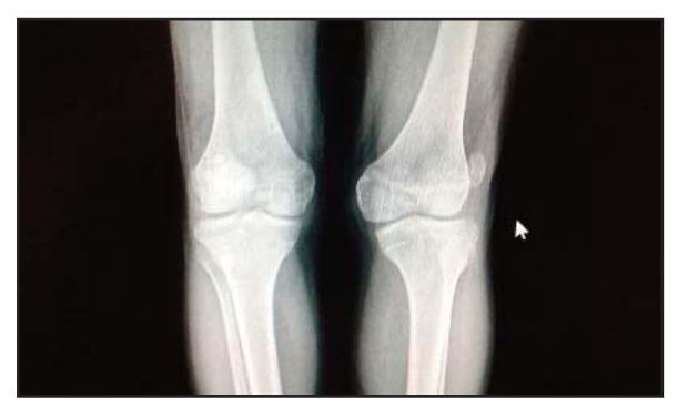
Figure 2. Right tripartite patella with lateral subluxation and left hypoplastic patella with lateral dislocation

iliac crest, which are pathognomonic of NPS [2, 3, 4, 5, 6]. Patients with renal disease show proteinuria, microscopic haematuria. Proteinuria occurs in 30%-50% of affected patients, end-stage renal disease (ESRD) occurs in about 5% of affected patients [7, 8]. Nailpatella syndrome affect the nails. It most frequently involves the thumb. Other fingers may be involved too. In this syndrome the nails are absent or hypoplastic. The nail dystrophy is generally more visible on the ulnar side of the digit. A triangle-shaped lunula is usually seen. The toenails being only rarely affected. Nail changes include reduced size or absence, spoon-shape and fragility. Absent skin creases on the dorsal aspect of distal phalangeal joints represent another common finding of this syndrome. In our patient the thumbnail of the left hand was hypoplastic. And triangular lunulae was seen on the second and third digit of the left hand. All skin creases on the dorsal aspect of distal phalangeal joints was absent [1, 2, 3, 4].