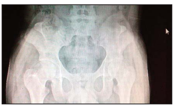
Figure 3. Bilateral posterior iliac horn

NPS is distinguished from other diseases associated with proteinuria by the electron microscopic characteristic features of irregular and lucent rarefactions containing clusters of cross-banded collagen fibrils within the GBM. The clusters of fibrils are clearly demonstrated by staining with phosphotungstic acid [8]. Other types of glomerulopathy have also been reported in previous studies: membranous