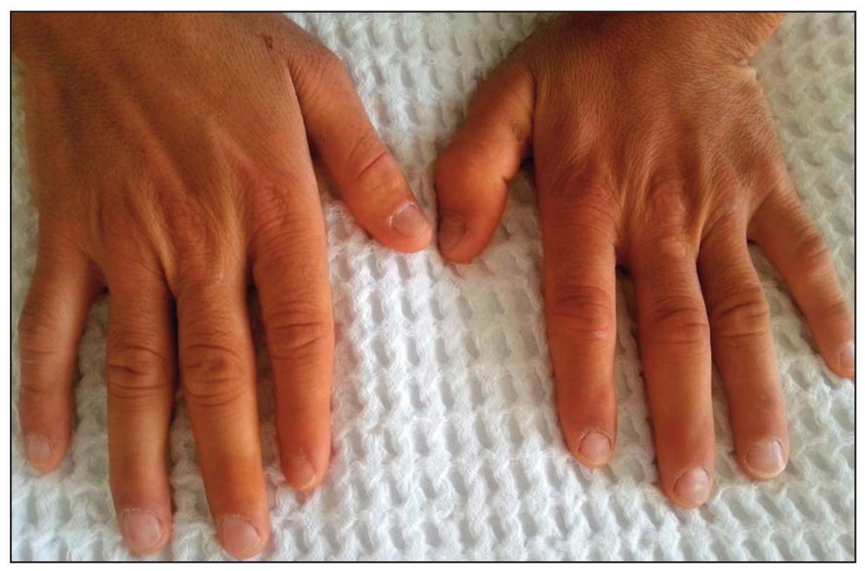
Figure 1. The thumbnail of the left hand was hypoplastic. And triangular lunulae was seen on the second and third digit of the left hand. All skin creases on the dorsal aspect of distal phalangeal joints was absent

consisted of about 41 glomeruli. Biopsy revealed total sclerosis in 5/41 (12%) of the glomeruli and focal and segmental sclerosis in 3/41 (%7) glomeruli. Some glomeruli enlarged and demonstrated mild focal mesangial hypercellularity. Immunofluorescence examination revealed depositions of C3 (2+) and IgM (1+/2+) in the mesangial areas, but no any depositions for IgG, IgA, C1q, fibrin, lambda and kappa light chains were seen.