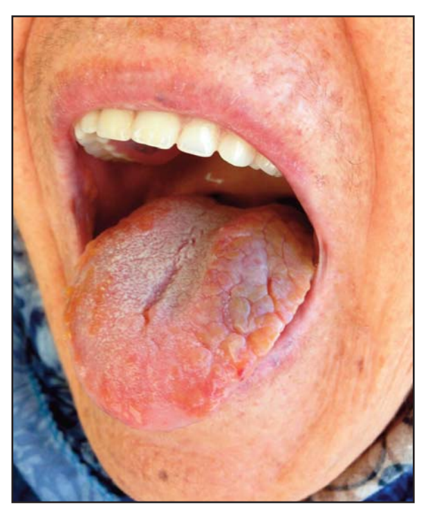
Figure 2. Primary systemic amyloidosis with involvement tongue

areas accompanying asymptomatic yellowish papules and inside the lower lip are observed (Figures 1 and 2). Gray-brown papuler lesions were seen on the gluteal region and around the anus (Figure 3). Hematoxylin and eosin staining was demonstrated intense eosinophilic amyloid deposition that is characterized with long and thin cleavages; from the dermal biopsy obtained from tongue, internal part of lower lip and gluteal area. In the immunohistochemistry positively staining with Congo red, AL amyloid accumulation with orange and light brown colors and typical image of amyloid with apple-green color staining, under polarized light has been showed (Figures 4a, b and c). Amyloid deposits in abdominal subcutaneous fat biopsy performed negative. Complete blood count tests (platelet: 376x109/l, leucocyte: 10x109/1, sedimentation: 38mm/hour) increased borderline. Biochemical tests included serum albumin, globulin, lactic dehydrogenase, calcium, renal and liver function tests, and posterior anterior lung graphy were evaluated as normal. Mild proteinuria identified on 24 hours urine test with result of 20mg/dl (Normal:1-14). In serum and 24-hour urine immunofixation electrophoresis confirmed immunoglobulin kappa light chain mo-