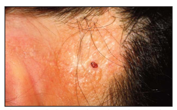
Figure 1. Multiple yellowish papules coalescing to form plaques on the left postauricular region (4 mm-punch biopsy site is seen on the middle of the plaque)

A 20- year- old female presented with asymptomatic skin lesions in the postauricular area for 2 years. She was otherwise healthy. Dermatological examination revealed multiple yellowish papules coalescing to form plaque on the left postauricular region ( Figure 1 ). A- 4mm- punch biopsy was made from one of the yellowish papules which revealed hyperplastic sebaceous glands ( Figure 2 ). The diagnosis was sebaceous hyperplasia en plaque.