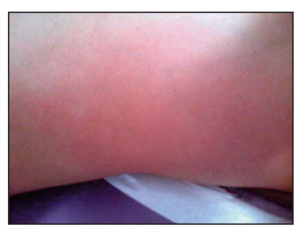
Figure 2. After 'wipe test'disappearence of lesions

There are small number of reports about TFF in literature. In the literature, the largest case serie consists 31 cases. The study reported by Berk from America [5]. In this study female/male was 1,2. Only 2 patients were older than 17 years. Child/Adult 29/2. In the study presented by Browning and friends [6] there were 6 patients. F/M was 0.5. Only one patient was child others were adult. In