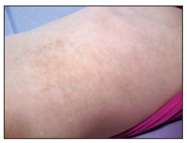
Figure 1. Dirt-like discolouration, brown patch and plaques on the arm