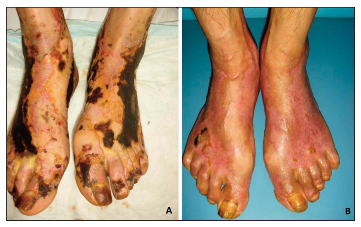
Figures 1A and B. A. Necrotic skin lesions. B. Healed skin after one month of the treatment

was a high morbidity, since our patient was almost immobile, because of painful necrotic lesions. He suffered from diabetes mellitus for five years and panic attack for ten years. He was using alprozolam and metformin with videgliptin combination. No other drugs he used before the development of skin lesions.