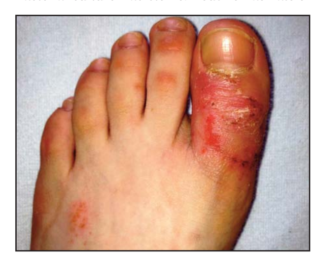
Figure 1. Eczematous scaly patches and pustular eruption on the left great toe

history of new shoes, synthetic socks. Family history was normal. Dermatological examination of the left great toe revealed eczematous scaly patches and pustular eruption ( Figures 1 and 2 ). Potassium hydroxide examination of the skin scrapings showed no evidence of fungal infection. Bacterial culture was sterile. Routine haematolo-