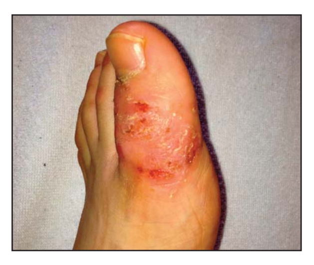
Figure 2 . Eczematous scaly patches and pustular eruption on the left great toe

gical and biochemical investigations were within normal limits. Histopathology of the lesion revealed hyperkeratosis, parakeratosis, mild acanthosis, and papillomatosis with infiltrate around the dilated blood vessels ( Figure 3 ). Based on the clinical, and histopathological findings, he was diagnosed with parakeratosis pustulosa. The patient was treated with topical calcipotriol, which resulted in marked improvement of within two weeks period.