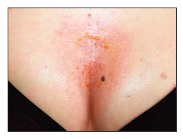
Figure 1. Crusted erythematous papulovesicular