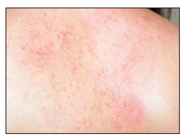
Figure 2. Erythematous papulovesicular eruption on

A 4 mm punch biopsy specimen was performed from the papulovesicular lesions on her right scapula with initial diagnoses of prurigo pigmentosa, Grover's disease, contact dermatitis, herpes simplex infection. Histopathological examination revealed parakeratosis, focal suprabasal acantholysis, perivascular lymphocytes and sparse eosinophils in superficial dermis (Figures 3 and 4). Direct immunflorescence was negative. Her laboratory examination was totally normal. Herpes simplex virus type 1 and 2 Ig M, and Ig G were negative. She was diagnosed with transient achantolytic dermatosis with her physical examination and laboratory findings. Her lesions were controlled with topical corticosteroid therapy.