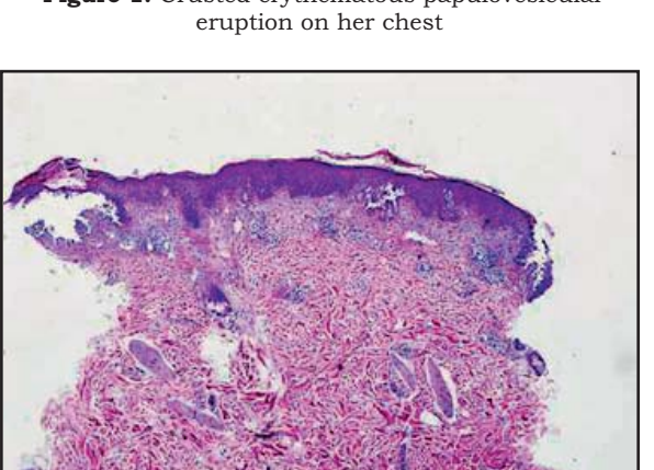
Figure 3. Focal acantholysis in epidermis (H&Ex4)

clinics for these lesions and misdiagnosed as recurrent herpes simplex infection. Systemic acyclovir treatment was given but these lesions were resistant to this treatment.