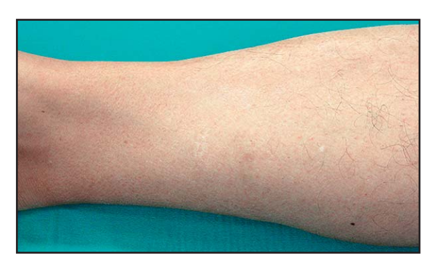
Figure 1. Normal clinical appearance of the painful skin

A glomangioma is typically a small, painful and cold-sensitive lesion occurring in the finger tips usually under the nail. It measures