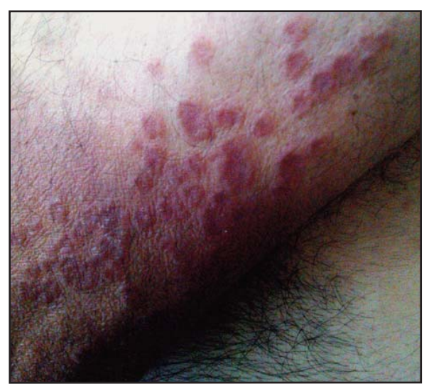
Figure 2. Annular erythematous papules and atrophic plaques with elevated border and on the arm

Histological examination revealed dermal infiltrate of multinucleated giant cells and macrophages, some of which contained fragments of actinically damaged elastic tissue (elastophagocytosis), and loss of elastic fibers in the center of the lesion. There was absence of necrobiosis and mucin ( Figure 3 ). Since the patient stated that topical treatments previously used were unsatisfactory, a treatment model of hydroxychloroquine 400 mg/d has been started and the patient is still in our follow-up.