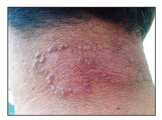
Figure 1. Annular erythematous lesions on the nape of the neck