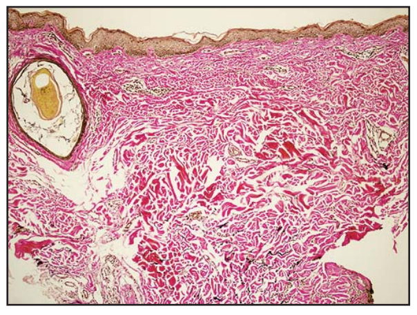
Figure 4. Thinning, fragmentation and absence of elastic fibres (elasti van Gieson, X 25)