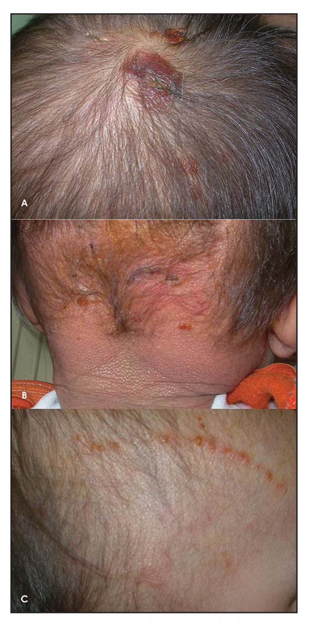
Figure 1A, 1B, 1C. Multiple tense vesicles, bullae, erosions and hemorrhagic crusts on the scalp.

laboratory investigations including complete blood count, erythrocyte sedimentation rate, urinalysis, histamine in urine, serum chemistry profile, Ig E and bone marrow aspiration were within the normal range or negative. No abnormal data could be seen in his abdominal and pelvic sonography. The culture from the blister was negative. Skin biopsy from a lesion showed a dense dermal cellular infiltrate identified as mast cells by toluidine blue staining ( Figure 3A, 3B ). The direct immunofluorescence was negative. The diagnosis of bullous mastocytosis was made based on these clinical and histopathological findings. The patient was treated with \rm H_1 and \rm H_2 blockers (hydroxizine and ranitidine) and ketotifen to which there was no sa-