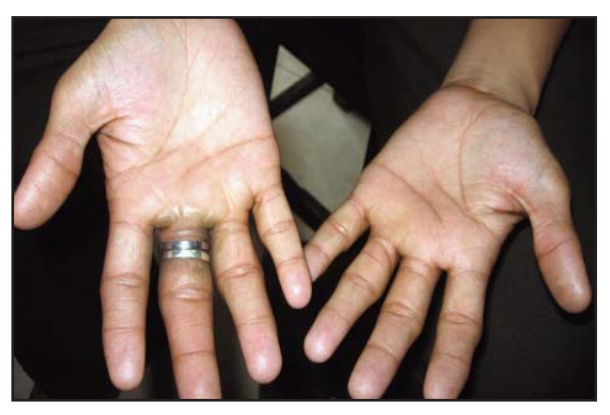
Figure 2. Sparing of palmar surface

Published: J Turk Acad Dermatol 2009; 3 (4) : 93401L; This article is available from: http://www.jtad.org/2009/4/jtad93401L.pdf Key Word: pachydermodactyly