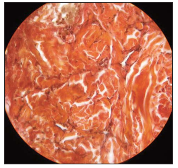
Figure 4. photomicrograph (VVG stain X 400) showing increased collagen

lagen sometimes arranged haphazardly arranged, slight proliferation of blood vessels with little or no inflammatory cells. Draluck et al using special stains showed increased deposition of collagen and mucin in dermis [5]. Further studies revealed increased collagen is of type 3 and 5, deviation from normal collagen profile [5]. Moreover diameter of collagen fibrils were found to be low by electron microscopy. Differential diagnosis include knuckle pad, post traumatic callosity, foreign body granuloma, fibroma, rheumatoid nodules, arthritis, thyroid acropachy. There is no successful therapy available. Topical therapy