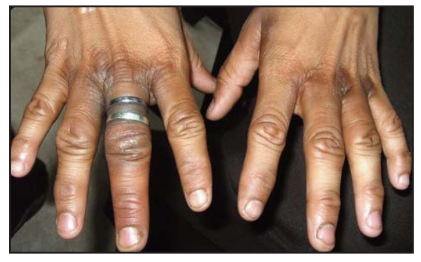
Figure 1. Bilateral diffuse ill-defined swelling over PIP and MCP joints

Pachydermodactyly was first described by Bazex et al in 1973 as pachidermie digitale des primières phalanges [2] but later in 1975 was recognised as a variant of knuckle pad by Verbov. It is an acquired disorder affecting young males almost exclusively, though familial and female case have been reported in literature. Clinically it is characterized by soft tissue swelling over dorsal and lateral part of proximal phalanges bilaterally. Distal involvement is rare. Involvement of only 1 finger is extremely rare- only 4 cases have been reported [3]. The etiology is largely unknown but repeated minor trauma was postulated as etiology [3]. Baldazzi and cols has described five types [4] - classical form, localized form (monopachydermodactyly), transgressing form, familial and associated with tuberous sclerosis. Biopsy from the lesion shows hyperkeratosis, hypergranulosis overlying thickened dermis-consisting of increased col-