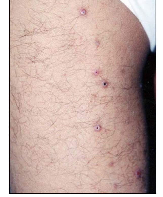
Figure 2. Lateral aspect of the left thigh

lagenosis, perforating folliculitis and elastosis perforans serpiginosa take place. These acquired perforating dermatoses usually have been associated with diabetes mellitus or chronic renal failure. It has been also reported with other conditions including tuberculosis, pulmonary aspergillosis, scabies, atopic dermatitis, AIDS, neurodermatitis, malignant, hepatic and endocrinological disorders [ 5 , 6 , 7 ].